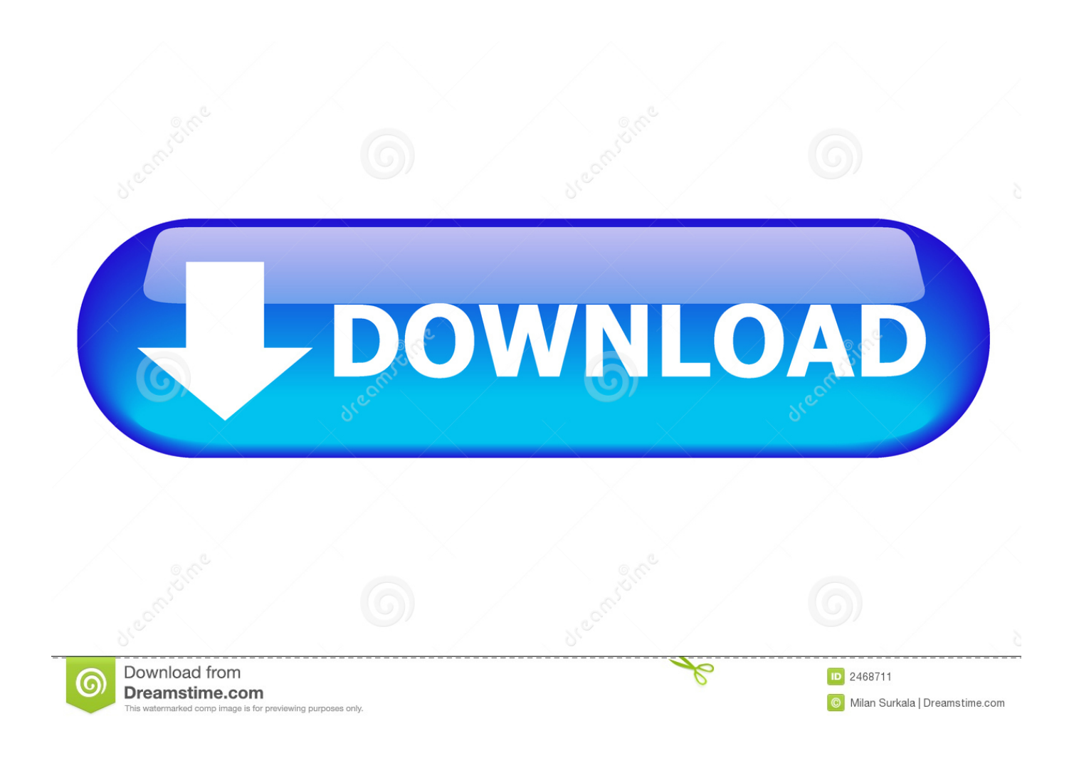
Horiba Pg 250 Service Manual